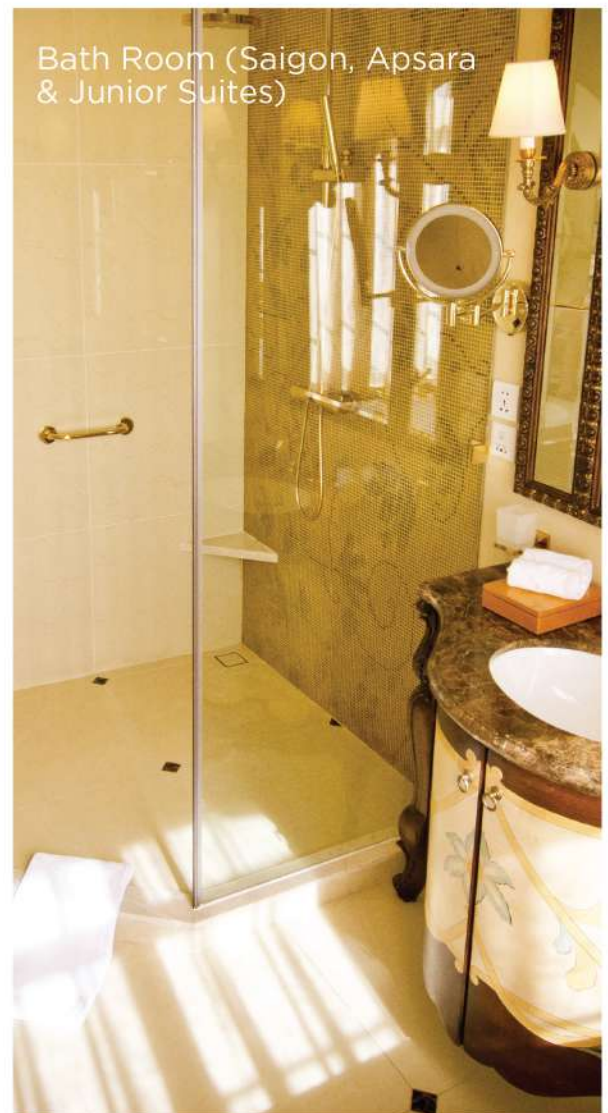
Bath Room (Saigon, Apsara & Junior Suites)