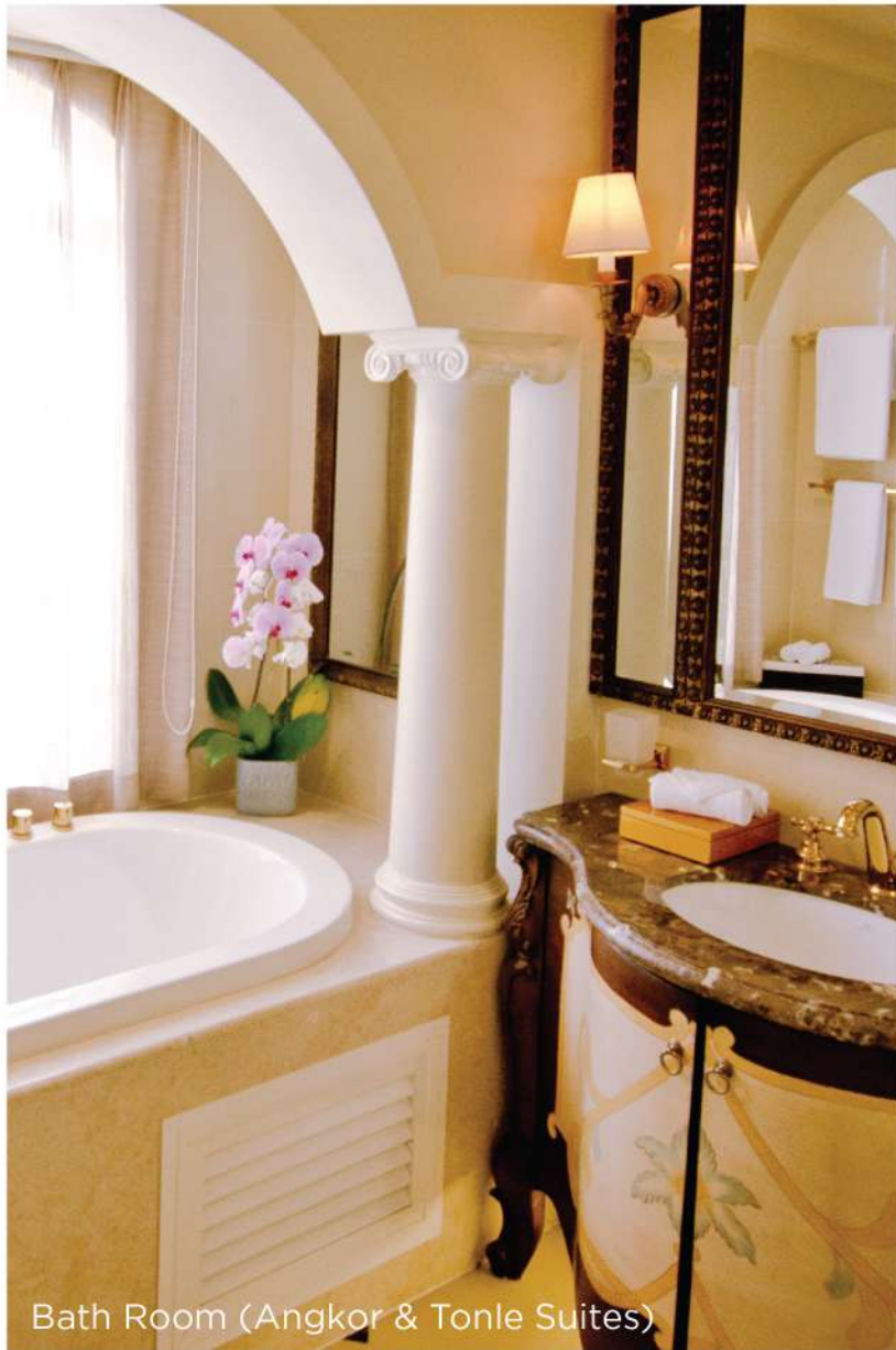
Bath Room (Angkor & Tonle Suites)