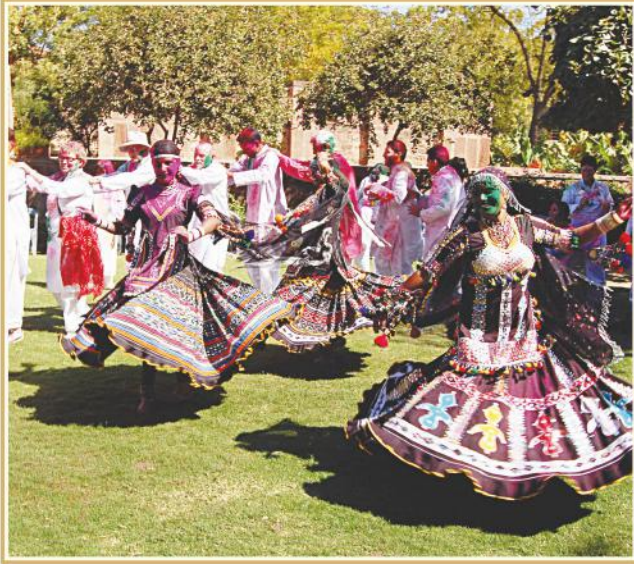
Enjoy Holi Festival