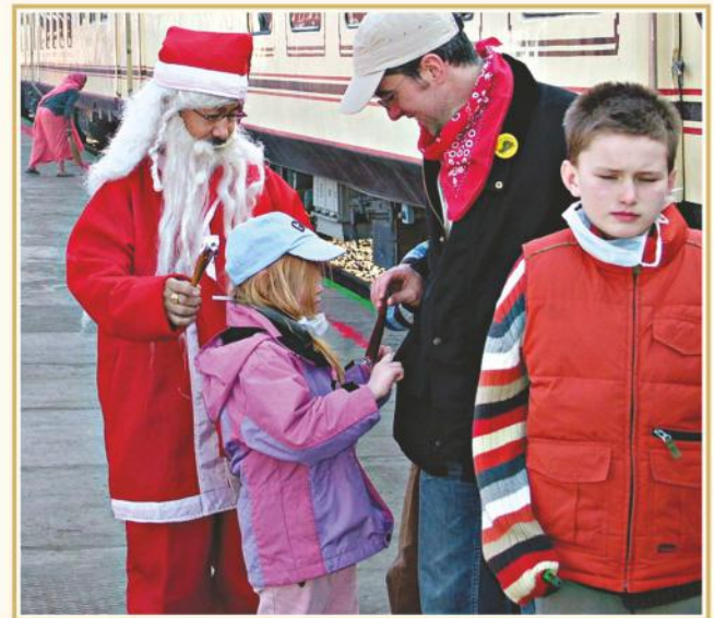
Santa distributing gifts