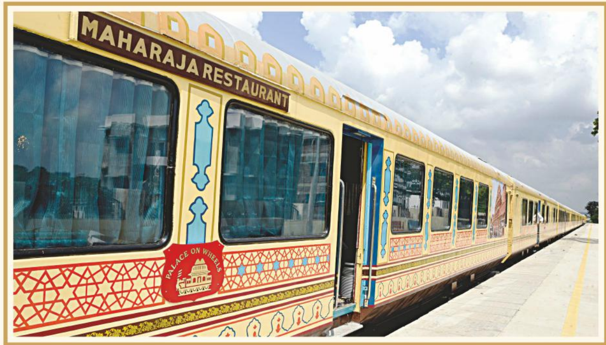
Luxury Train Palace on Wheels

The most Enjoyable experience of Incredible State of India!