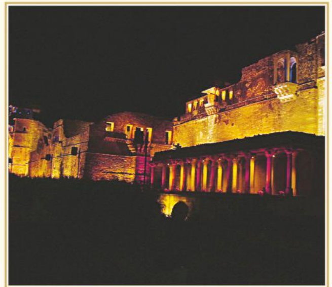
Light & Sound show at Chittorgarh Fort

5th to 8th century period, this fort covers an area of 680 acres. The fort is accessible through seven gates. Important places here are Rana Kumbha palace; Padamini's Palace; Vijay Stambh and various temples and kunds. Enjoy the light and sound show at the fort. Followed by dinner on board